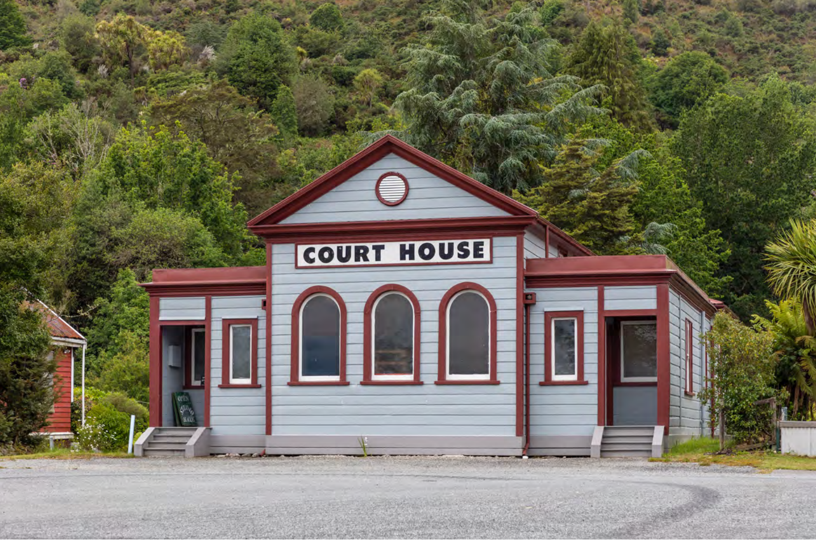
Caption: The historic wooden Court House in the small West Coast town, Reefton.